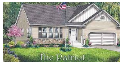
Artist's rendering of one of the houses

Applicants for the homes should write a letter to LIHBCDC, 1757-7 Veterans Memorial Hwy., Islandia, NY 11749 with contact information, military service, present employment and living status and why the home would be life-changing.